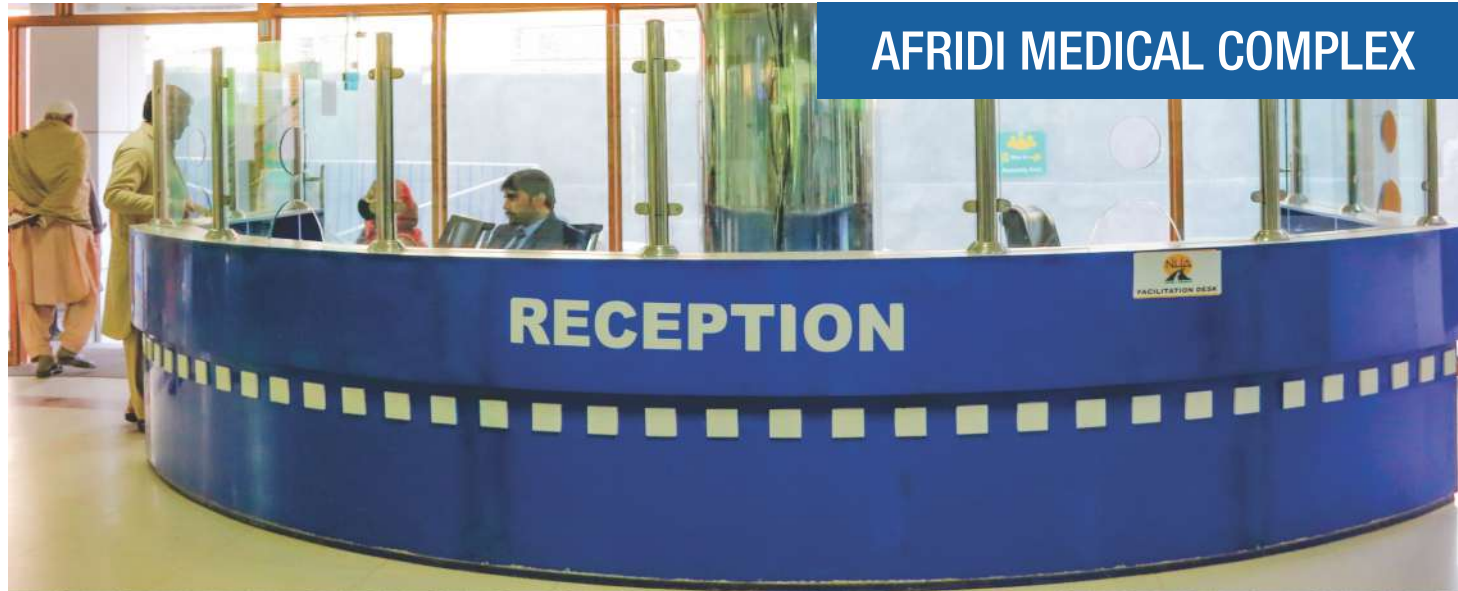
AFRIDI MEDICAL COMPLEX