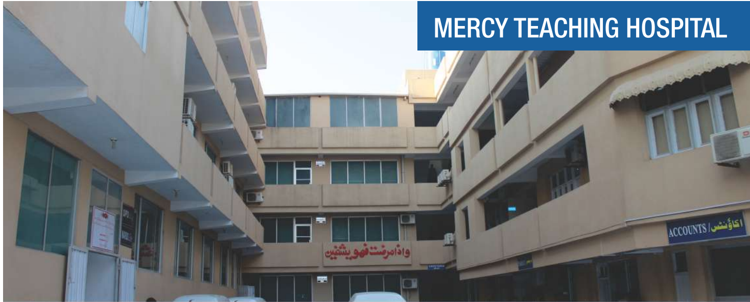
MERCY TEACHING HOSPITAL