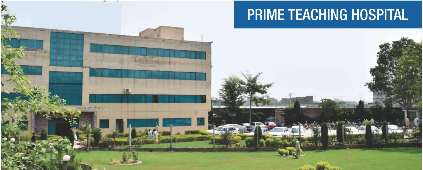
PRIME TEACHING HOSPITAL